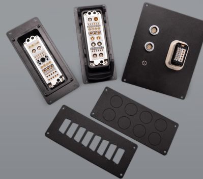
Flange plates in various options available