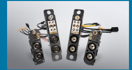
ODU-MAC® Power Connector