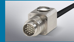
ODU DOCK Silver-Line