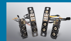
ODU-MAC® Power Connector